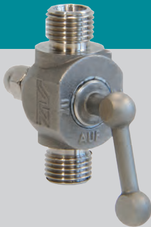
Type VINTAGE oil valve